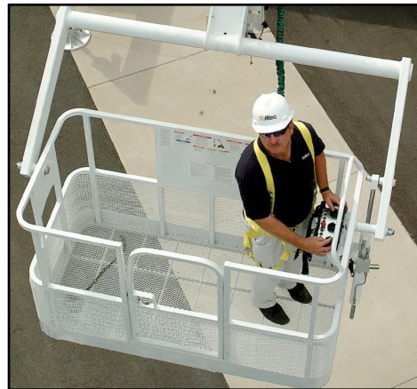
Optional 2-Man Platform