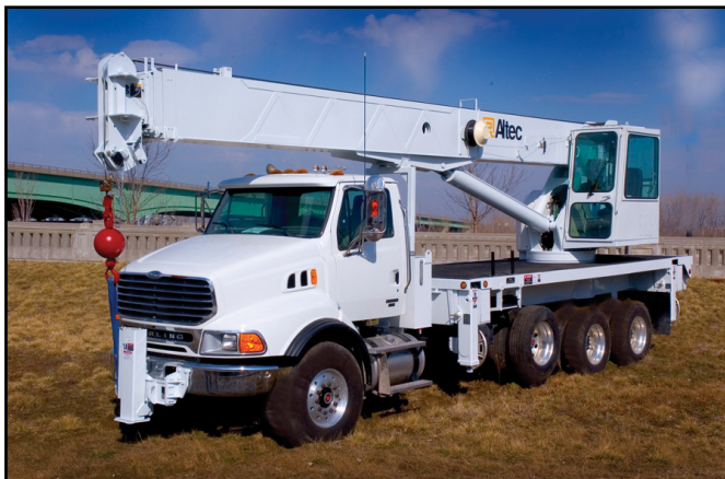
Vehicle Travel Height of 12.9 ft (3.9 m)

Ontario Service Center 831 Nipissing Road Milton, Ontario L9T 4Z4