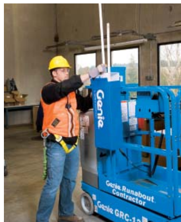
Fluorescent Tube Caddy (only available on narrow or standard platform)