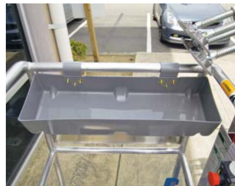
Work Station Tray (not available on narrow or ultra-narrow platforms)