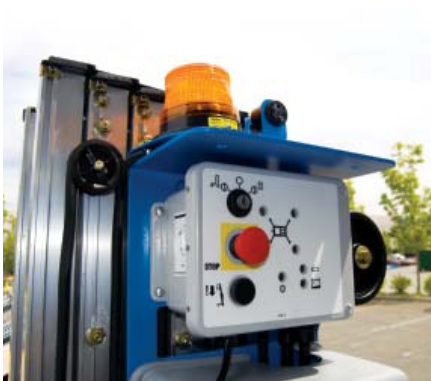
Operational Warning Light